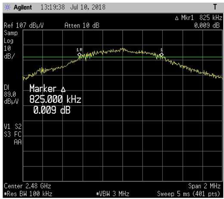
BLE modulation, 2 Mbit data rate