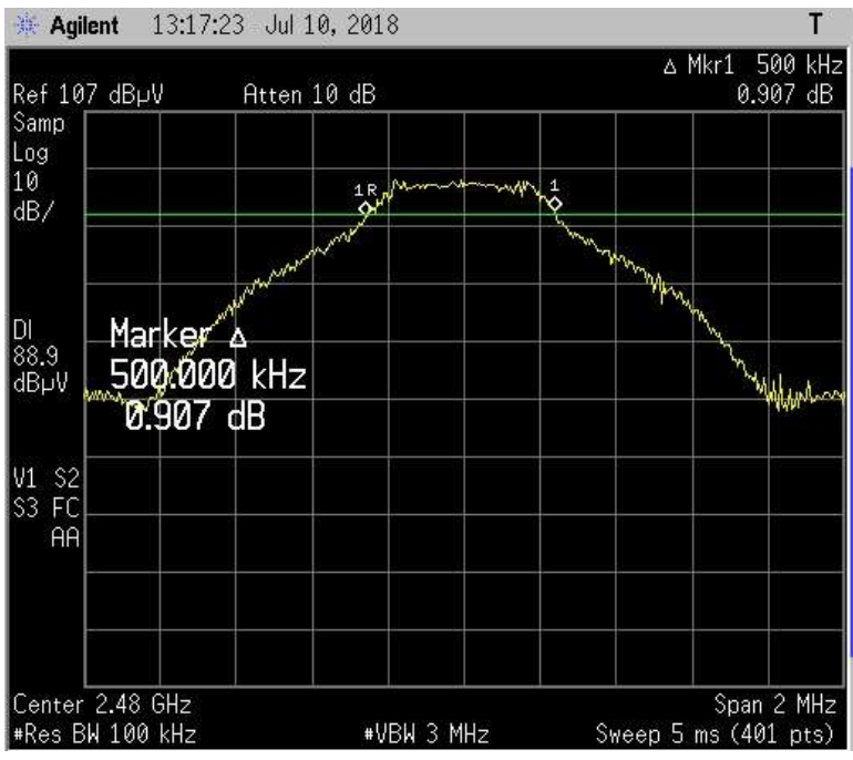
BLE modulation, 1 Mbit data rate