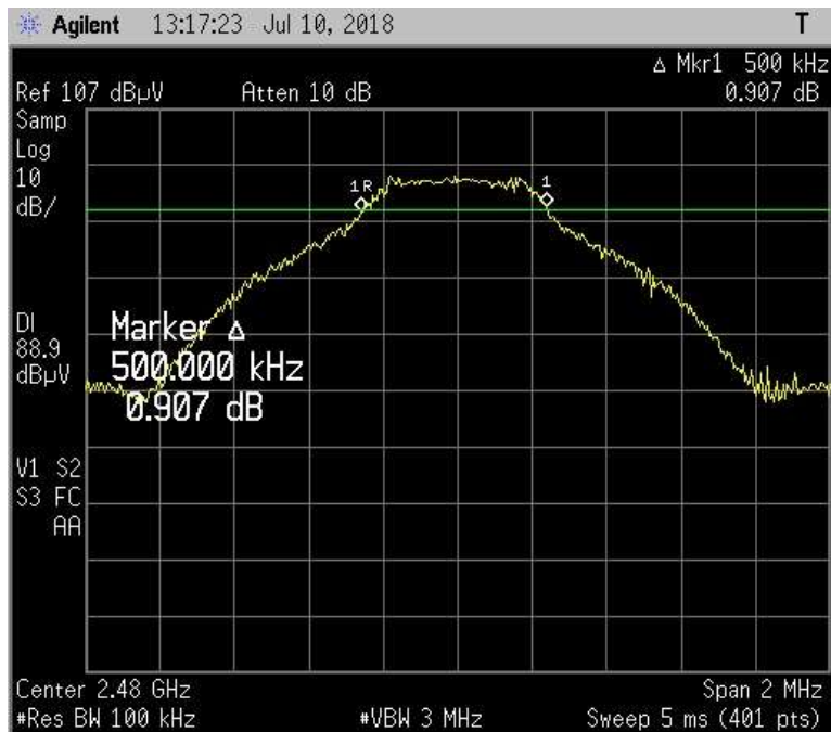
BLE modulation, 1 Mbit data rate

FCC Part 15.247, (a)(2): Systems using digital modulation techniques may operate in the 902-928 MHz, 2400-2483.5 MHz, and 5725-5850 MHz bands. The minimum 6 dB bandwidth shall be at least 500 kHz.