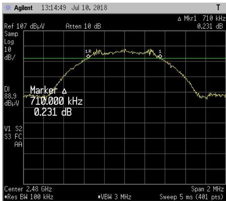
Nordic modulation, 2 Mbit data rate