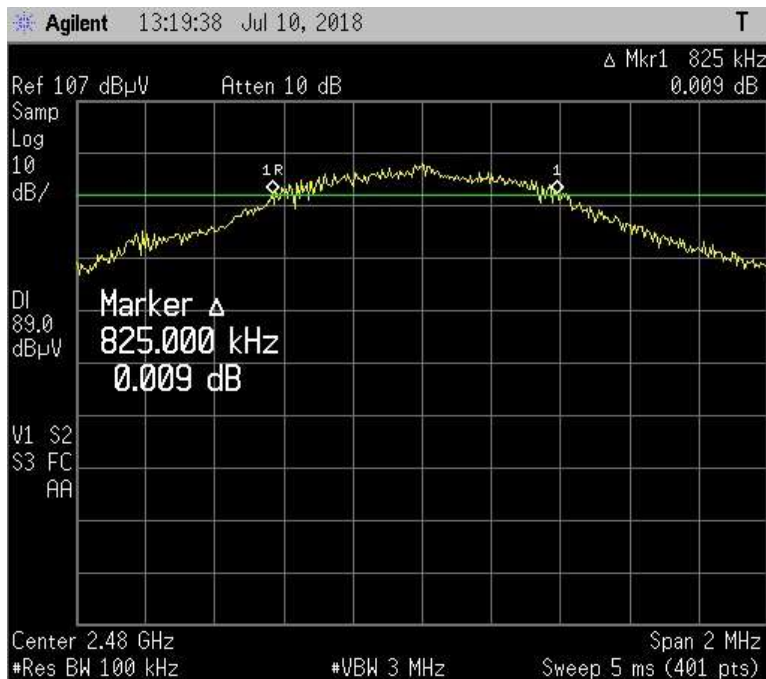
BLE modulation, 2 Mbit data rate